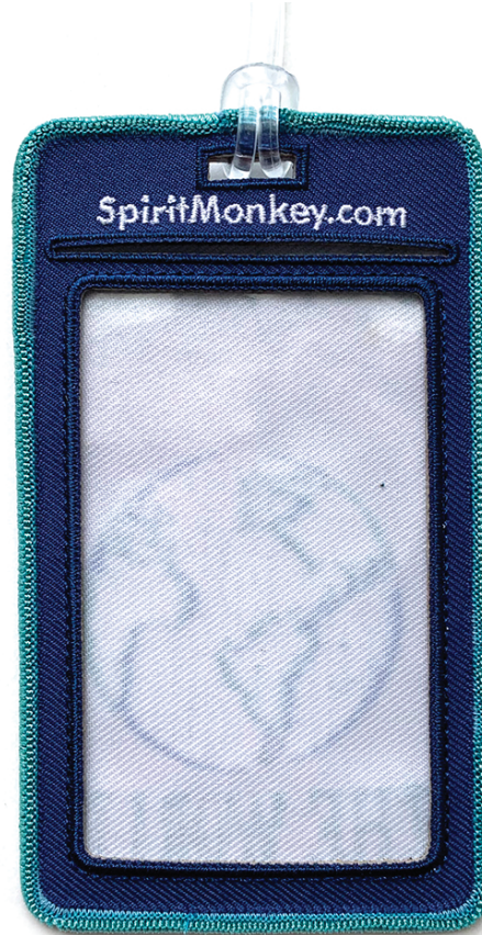
SAMPLE BACK LUGGAGE TAG